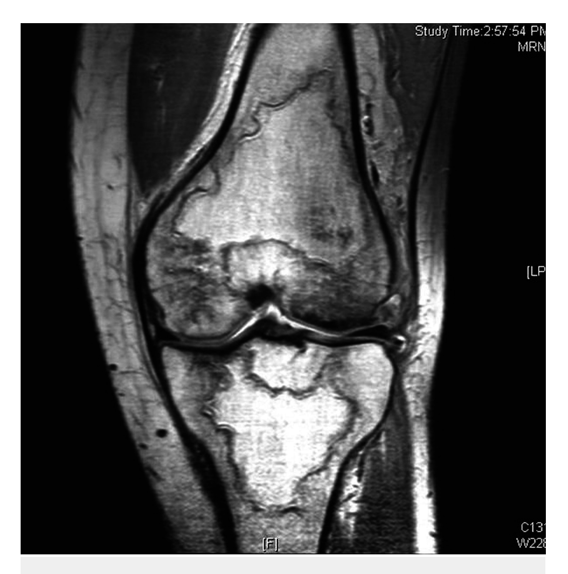
FIGURE 5: MRI of the knee showing multiple infarcts

AVN in SCD is different from AVN due to other causes. In SCD, the entire epiphysis of the long bone is uniformly affected while, in other conditions, the weight-bearing areas are commonly involved. The initial infarcts often occur in the subchondral regions where the collateral circulation is minimal. The overlying articular cartilage often remains viable in the early stages of the disease because it receives nutrition from the synovial fluid. If the pace of the "creeping substitution" within the subchondral infarct is too slow to be effective, then micro-fractures develop that eventually lead to the collapse of necrotic cancellous bone and ultimately to joint destruction [13]. This almost always includes the anterior superior portion of the proximal femur, where the weight-bearing forces are the greatest [14]. Early reports have found a higher rate of AVN in homozygous SCD compared with other sickle mutations. However, recent studies have not been able to find any significant difference between the Hb SS or Hb SC genotype [15-16]. These studies have reported several mutations, unrelated to the haemoglobin disorder, which influence the severity of the disease by altering the genes involved in its pathophysiology [17].