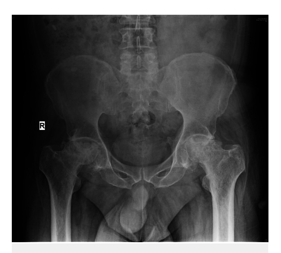
FIGURE 3: X-ray pelvis anteroposterior view showing avascular necrosis of the head of the femur

Other sites affected are the shoulder, knee, and talus as shown in Figures 4-5.