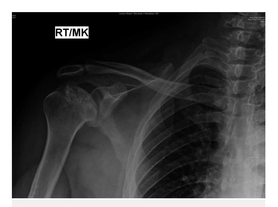
FIGURE 4: X-ray right shoulder anteroposterior view showing avascular necrosis of the head of the humerus