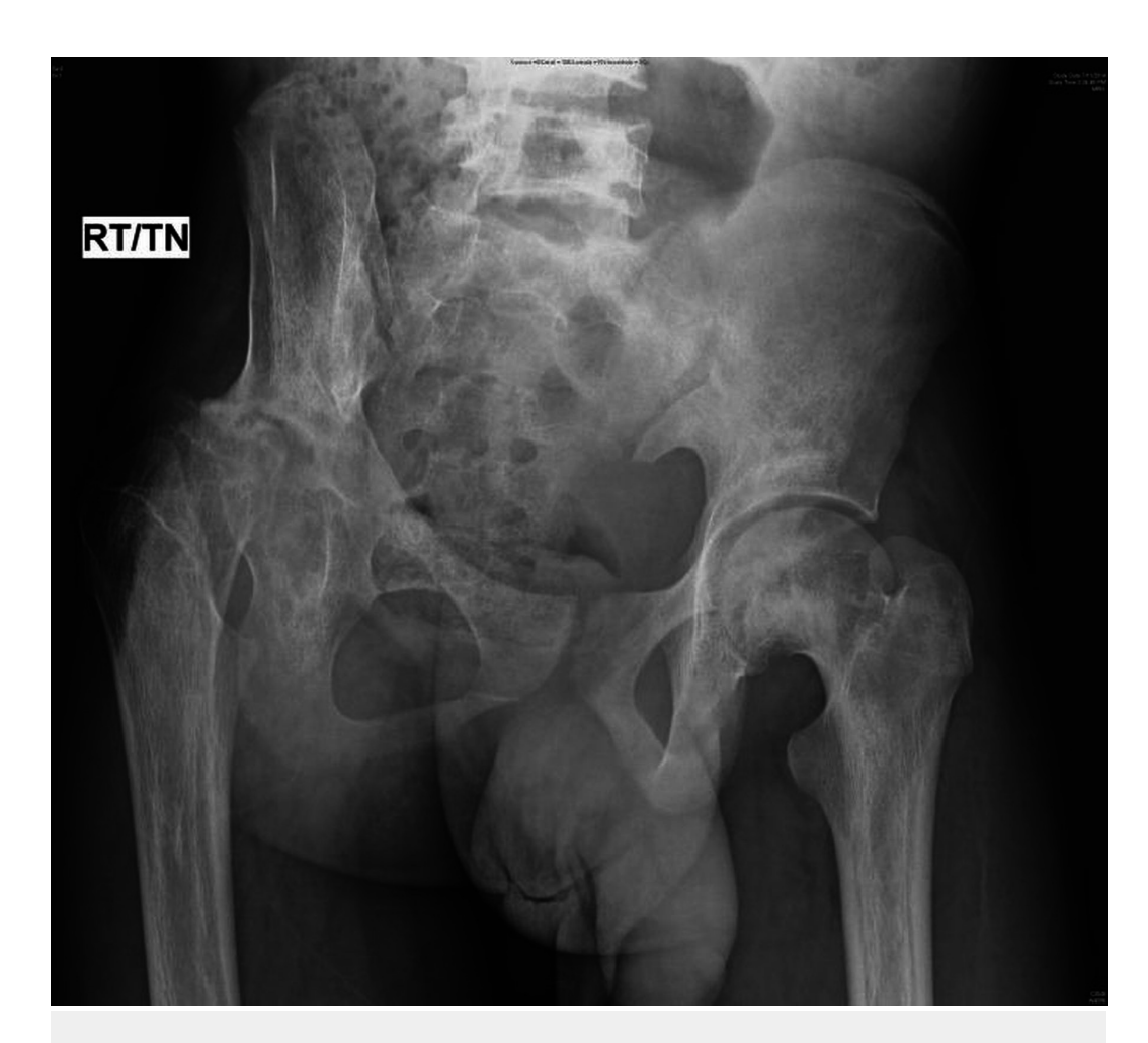
FIGURE 6: X-ray pelvis anteroposterior (AP) view showing retardation in growth of the proximal femur

The ongoing hematopoietic activity involving the skull bones leads to expansion and subsequent frontal bossing observed in some of these patients.