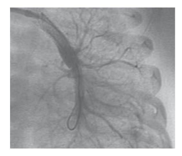
Fig. 3b. The PDA has been stented and the continuity of left subclavian artery, PDA and LPA is noted. LPA = left pulmonary artery; PDA = patent ducuts arteriosus;