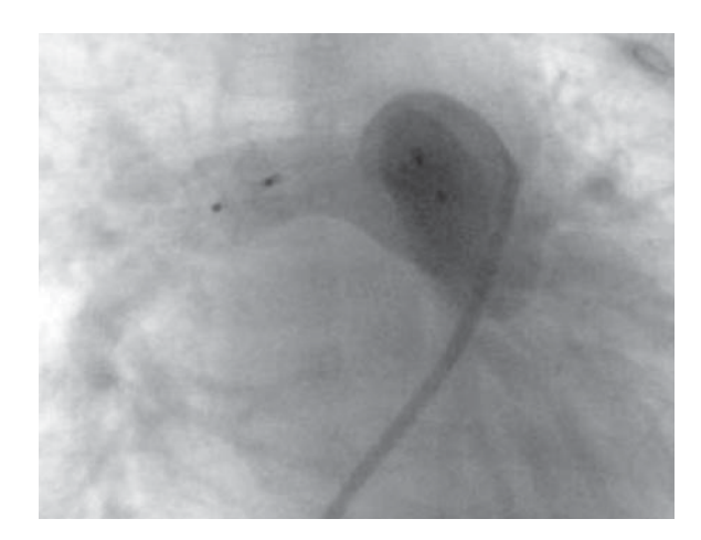
Fig. 2. The angiogram still frame shows bilateral flow restrictor implantation in each branch pulmonary artery.

Pulmonary artery banding is used as a palliation prior to muscular VSD closure or as part of other procedures like Damus-Kaye-Stansel or Norwood Stage I. It may also be used for reducing the pulmonary pressures in patients with high flow Single Ventricle physiology. The inability to predict the final PA pressure while banding the artery has resulted in several alternative techniques being looked at including externally adjustable bands. Flow restrictor implantation is also an attempt at replacing a surgical palliative procedure with a non-surgical interventional procedure. The procedure, as per personal communications, has been tried on about 14